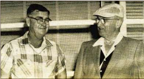
FILE Former President Harry S. Truman, right, stands outside the Bay Bourne with Shelton Stone, caretaker of the Olney Inn, in 1957. The estate’s market value lion by the Monroe County was estimated at $3.1 mil- Property Appraiser in 2016.

Gilmore Jr. of Kalamazoo, Mich., later purchased the property and added a second deck to the Bay Bourne. It was owned by the Gilmore Houseboat Trust of Otsego, Mich., until the recent purchase. The house boat features a stateroom, two baths, a galley kitchen and salon on the first deck, and a top deck with a four-bunk stateroom and private upper deck. The property also includes 300 feet of sand beach overlooking the Atlantic Ocean.